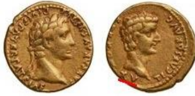
Figure 3 - Roman coin depicting the co-emperors from 12 to 14 CE, Tiberius on one side and Augustus on the other.

According to John the Apostle, Jesus died on the 3rd or 4th Passover of his ministry, depending on whether the unnamed feast (John 5:1) was the Passover. (The 3 named feasts are mentioned in John 2:13, 6:4, and 13:1). When we do the math, we find that the year of Jesus' last Passover, the one on which he died, was as early as 29 CE and as late as 33 CE, with 30, 31, and 32 CE being three other possible years. Therefore, according to Luke and John, Jesus died on the Passover in one of the five years, from 29 to 33 CE, which is from 3789 AM to 3793 AM .