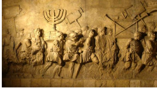
Figure 1 - Relief on the Arch of Titus, depicting the scene of the second temple's destruction on the 9th of Av in the year 3830 AM.

The angel Gabriel told the prophet Daniel what Judah's great sin was going to be. They were going to execute the Messiah (Dan. 9:26). Isaiah was told the same thing (Isa. 53:1-12). But like Ezekiel, Daniel was also told when Judah's great sin was going to be. However, instead of answering the question "when?" in number of years before an event, such as the destruction of the second temple, Daniel answered it in number of years after an event, namely, the "going forth of the commandment to restore and to rebuild Jerusalem" (Dan. 9:25). Artaxerxes gave both parts of the two-part commandment. He gave the restore part to Ezra in the 7th year of his reign (Ezr. 7:7) and the rebuild part to Nehemiah in the 20th year of his reign (Neh. 2:1).