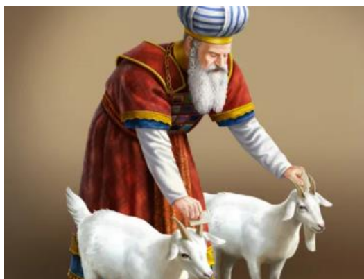
Figure 2 - The lot for the Lord came up in the left hand 40 feasts in a row, from 3791 to 3830 AM.

According to the Talmud, for 40 straight years (from 3791 to 3830 AM), the lot for the Lord came up in the left hand and the red strap remained red. The lot for the Lord coming up in the left hand 40 times in a row is like a coin flip landing on tails 40 times in a row. The odds of that are about a trillion to one! That miracle was a sign that the efficacy of the sacrifice was taken away in 3790 AM, sometime before the 9th of Av.